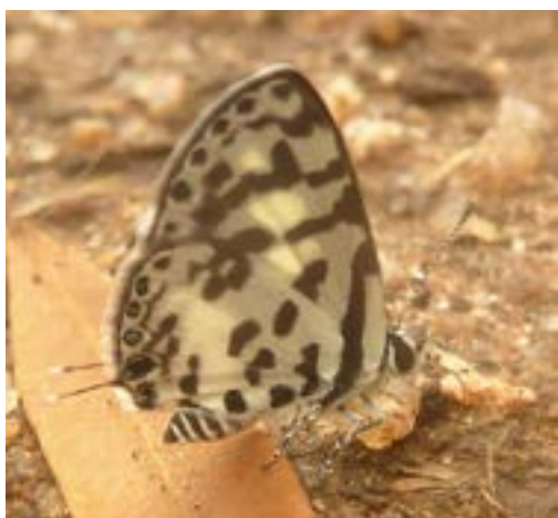
Tuxentius melaena - dark pied Pierrot