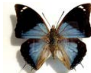
Charaxes bohemani