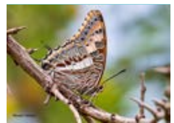
charaxes saturnus