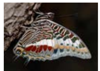
Charaxes castor